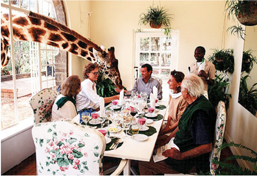
An inmate at Giraffe Manor may join you for breakfast, Nairobi, Kenya